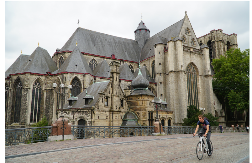
St. Michael's is one of three large churches in the center of Gent. It is highly unlikely that this young man on his bicycle will ever pass through its massive, ornate doors.

Most of the world does not enjoy that precious knowledge. Our problem in missions is how we not only introduce men and women to Christ, but also how we introduce them to His body — the Church. How do we, the churched, reach the